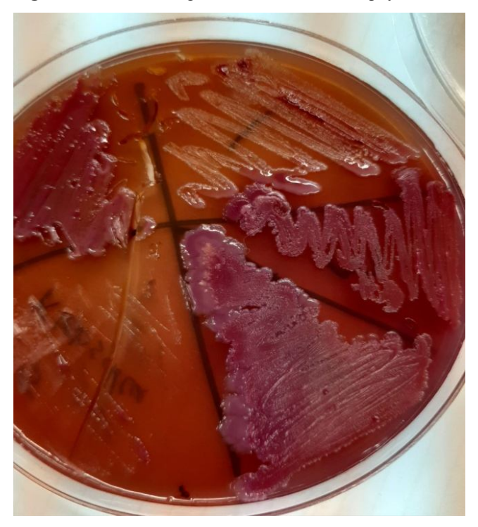
Fig. 4 : MacConkey Agar showed culture of Klebsiella.

internal organ followed by Klebsiella and Proteus then Salmonella and this agree with Mawak and Olukose (2008), when he isolated the same spp of bacteria in addition to Shigella spp with close percentages. Also current study agree with Ahmed et al. (2018), who stated that Pseudomonas , Staphylococcus and E. coli were the most frequent bacteria isolated from houseflies. The results in this study agree with Vazirianzadeh et al. (2008) and Moosa-Kazemi et al. (2010), who declared the presence of Pseudomonas , Proteus , E.coli and Klebsiella on the external surface of house fly also agree with their mentioned that Pseudomonas , Staphylococcus and E. coli and Klebsiella on the external surface of house fly also agree with their mentioned that Pseudomonas , Staphylococcus and E. coli were the most frequent isolated bacteria while