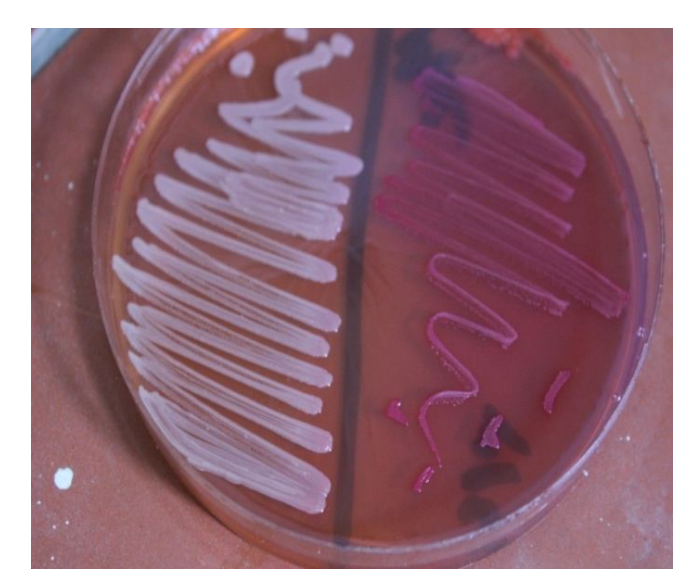
Fig. 1 : MacConkey Agar showed pink colonies and yellowish colonies.